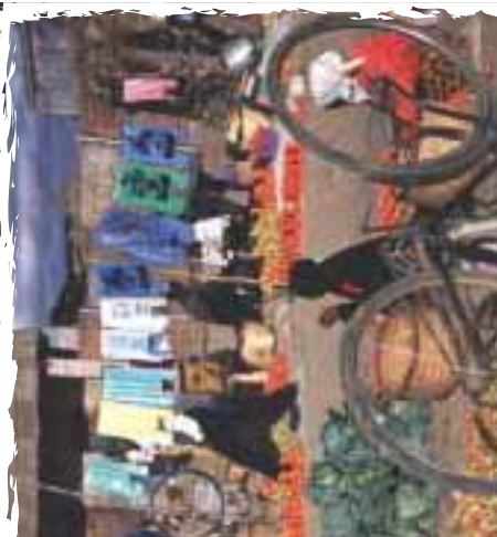
"Safe, reliable and cost-effective transport frees people to lift themselves out of poverty, and helps countries to compete internationally" The Sub-Saharan Africa Transport Policy Programme

Transaid's work in the transport and logistics sector is essential in the fight against poverty.