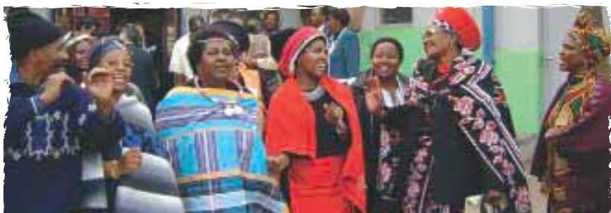
Impromptu musical celebrations outside the Alexandria Clinic in Johannesburg