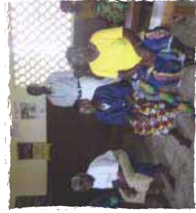
Waiting at a rural clinic, Sierra Leone Transaid

Take the case of Sierra Leone, the African country with the lowest life expectancy rate (37 years), where nearly 4 out of every 10 children die before their 5th birthday, and more than 60% of the population depend