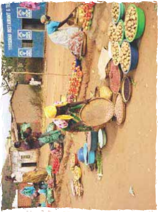
Roadside vegetable sellers at Dedza, Malawi. Just 80 kilometres away in the capital Lilongwe these same potatoes and tomatoes would sell at four times the price. If these women could transport their goods to the city both they and their customers would benefit.

inputs or the same level of production with a smaller input.