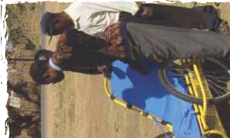
Roadtesting the trailer Transaid

The trailers will be trialled by the local bicycle taxi riders association as a simple low-tech, low-cost solution to local requirements for the carriage of